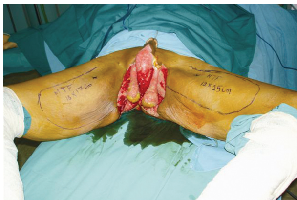
Fig. (2-A): A 48 year old male diabetic patient developed Fournier's gangrene with extensive soft tissue defect involving both testes, proximal penis, perineum and parts of the medial aspect of both upper thighs.