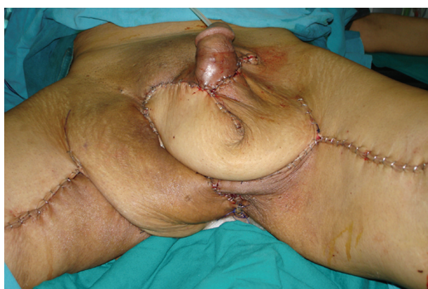
Fig. (2-C): Insitting of the flaps over the defects, the Lt. flap covered the penoscrotal area and the Rt. flap covered the perineum with direct closure of the donor sites.